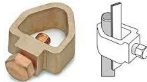
'G' Type Clamp