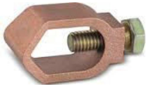
'A' Type Clamp

Natural, Nickle Plated, Zinc Plated or any coating as per customer specification.