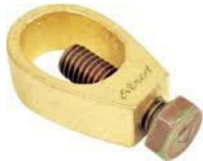
'O' Type Clamp